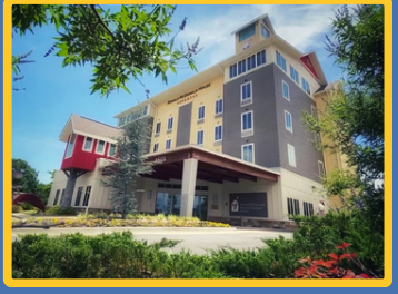
Ronald McDonald House

The 2024 data, found on Page 1, includes services provided by our three core programs plus our Hotel Program which sponsors brief, overnight hotel stays for families.